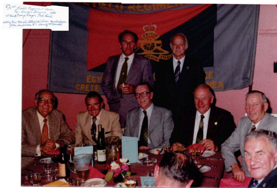
2nd /2nd Field Regiment Association Regimental Dinner 1980