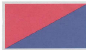
2/2 FIELD REGIMENT ASSOCIATION