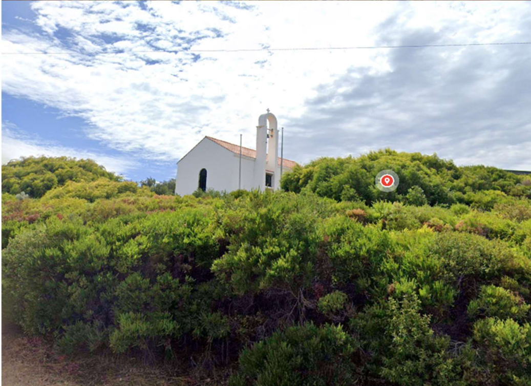
Google Maps ref: 2XCV+XH Prevelly, Western Australia