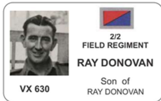
2/2 NAME BADGES $ 25

The regiment can also be supported through a range of 2/2 souvenirs.