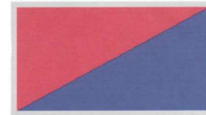
2/2 FIELD REGIMENT ASSOCIATION