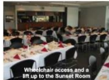
Wheelchair access and a lift up to the Sunset Room

We wish to make our 83rd Regimental Dinner one to remember by having as many 2/2 veterans and their families coming along to show that our association is to survive and to keep on commemorating our Fathers /Grand Fathers service to our wonderful country.