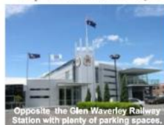
Opposite the Glen Waverley Railway Station with plenty of parking spaces.