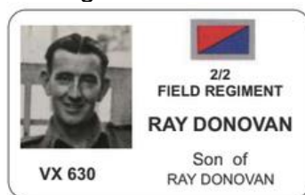
2/2 NAME BADGES $ 25

The regiment can also be supported through a range of 2/2 souvenirs