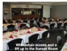
Wheelchair access and a lift up to the Sunset Room

We wish to make our 83rd Regimental Dinner one to remember by having as many 2/2 veterans and their families coming along to show that our association is to survive and to keep on commemorating our Fathers /Grand Fathers service to our wonderful country.