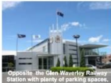
Opposite the Glen Waverley Railway Station with plenty of parking spaces.