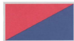
2/2 FIELD REGIMENT ASSOCIATION